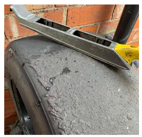
Its not all glamour and living the high life, cleaning a set of 8 tyres takes about 6 hours of laborious use of a surform and water!