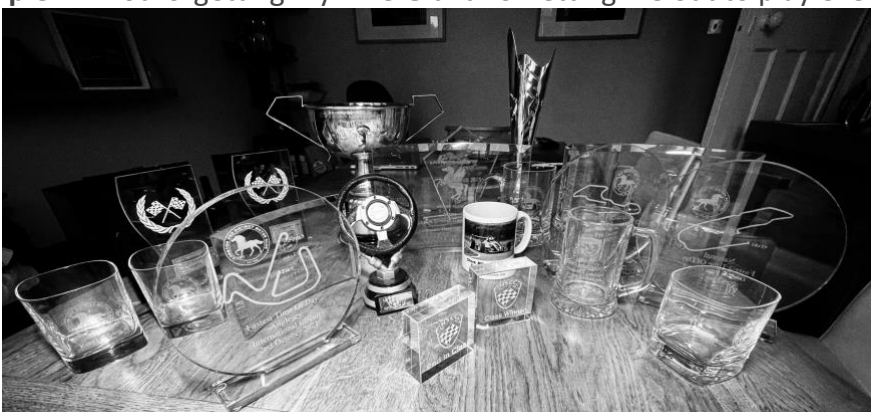
2021 season trophy haul – apart from the 'big one' in January