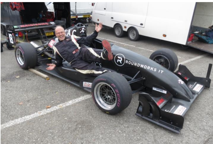
I didn't need much encouragement!