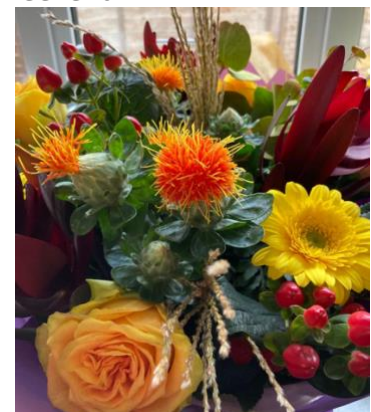
Never forget end of season flowers