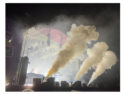
Link to compilation video of the weekend or just click the pictures directly above