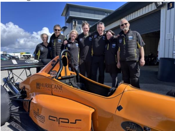
The full Faulkner team

The longer international circuit on Sunday should have suite