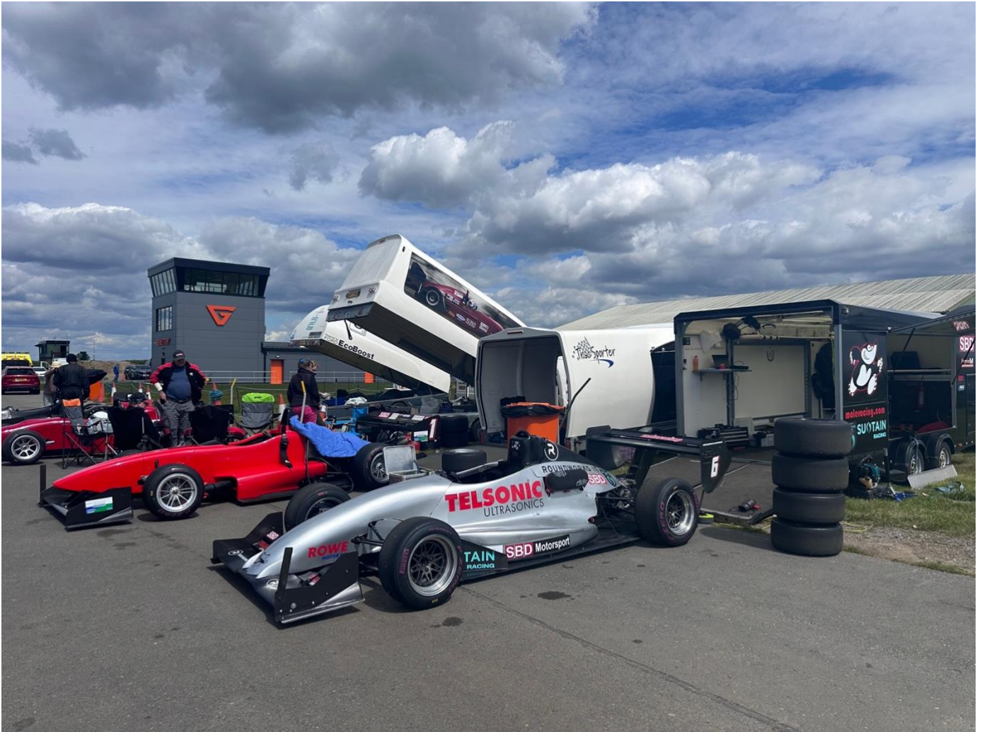
SBD cars and mine at Blyton – note the fancy new control tower in the background