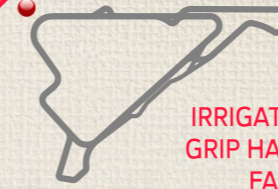
IRRIGATED WET GRIP HANDLING FACILITIES

There will be two hospitality buildings, one serving the new Stowe facility which can cater for 100 people, and the other serving our Southern Circuit for up to 60 people. Both buildings will have roof terrace viewing facilities along with briefing rooms and catering facilities. There will be nine pit garages capable of taking up to three cars each. Of which, two have extra height and will be fitted with lighting rigs and sound making them perfect for vehicle unveils and presentations.