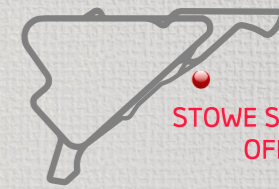
STOWE SPECIAL OFF ROAD STAGE

This will allow us to train drivers on a number of different braking techniques such as cadence braking, brake and avoid techniques as well as allowing us to again demonstrate various chassis technologies, such as ABS, brake assist, electronic brake distribution and ESP.